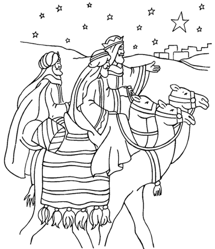
Wise Men Worship Jesus Matthew 2

Our Mission is to prayerfully: Seek God Grow in faith Love and Serve others For the transformation of live!