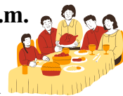
Photo Shoot area in overflow & special Easter Cafe

Easter Egg Hunt 10:00a.m. (activities in Overflow)